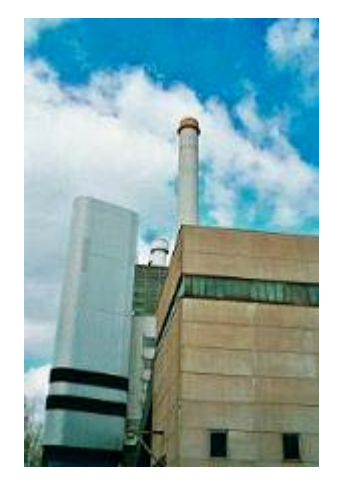
Munich's main heating power plant

Besides adding vector information VPraster also provides direct editing on the scanned raster drawings - a very comfortable way to apply modifications, especially when exact true to scale is a minor issue. In any case will the system offer as much flexibility as needed so that users can make their own decisions on the most suitable method.